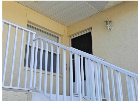
No Protection Throughout