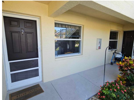
No Protection Throughout