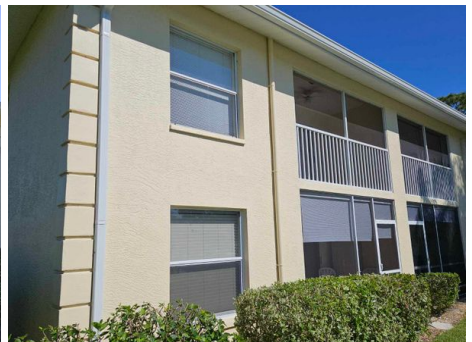
No Protection Throughout

Inspectors Initials TF Property Address 5709 Foxlake Drive, North Fort Myers, FL 33917