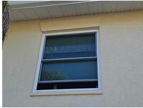
No Protection Throughout