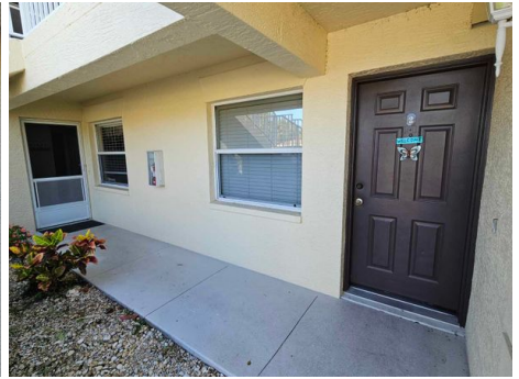
No Protection Throughout