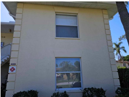
No Protection Throughout