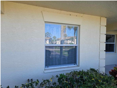
No Protection Throughout