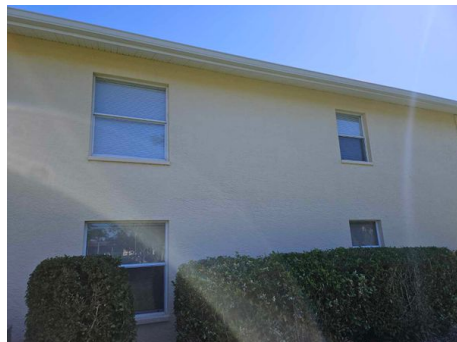
No Protection Throughout