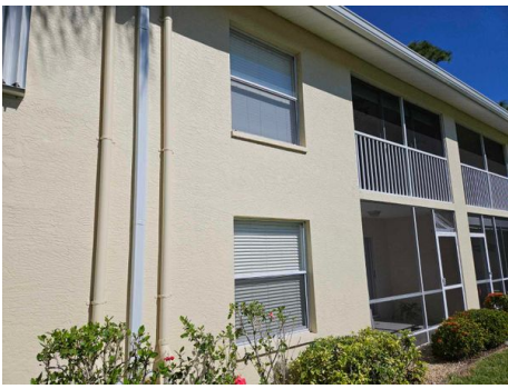
No Protection Throughout