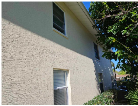
No Protection Throughout